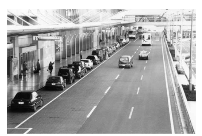
airport terminal / so

In this part, you can move to the next question by clicking on Next . If you want to return to a previous question, click on Back . You will have 8 minutes to complete this part of the test.